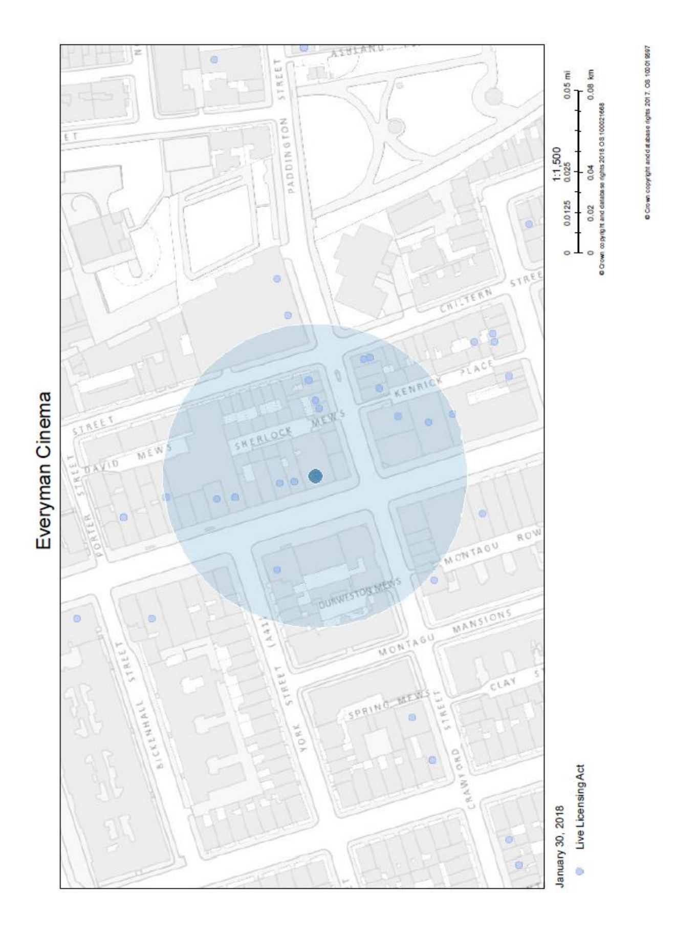
Resident count = 147